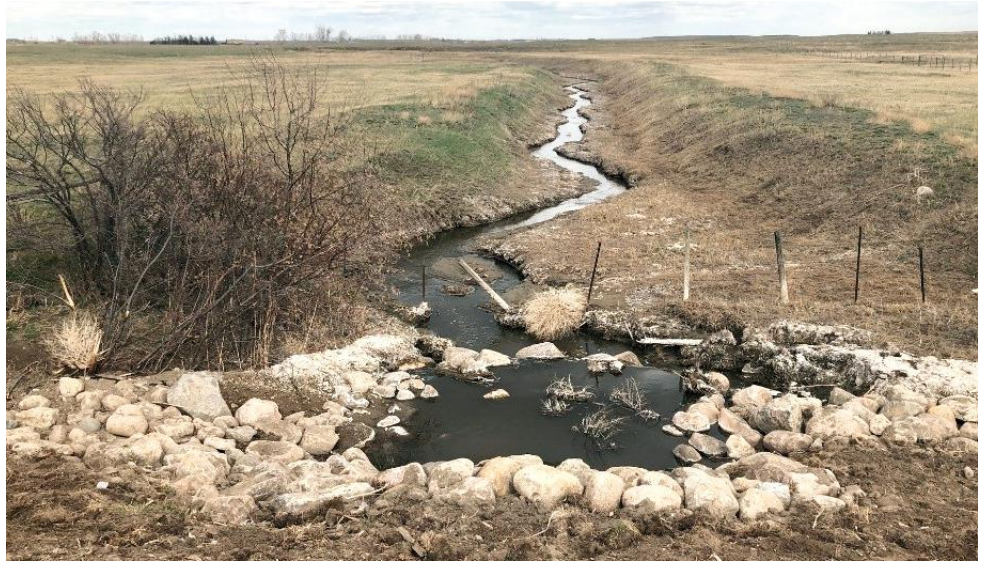
Bridge File 84230 - Completed downstream

As you come across the inconvenience of construction work this summer please be mindful of the workers. Construction is a necessity to ensure the services you enjoy today can continue to be provided. Don't RIP through construction zones, pass workers as if they were your family.