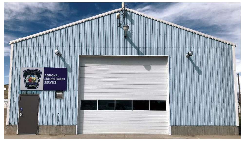
Community Peace Officer Station - Taber